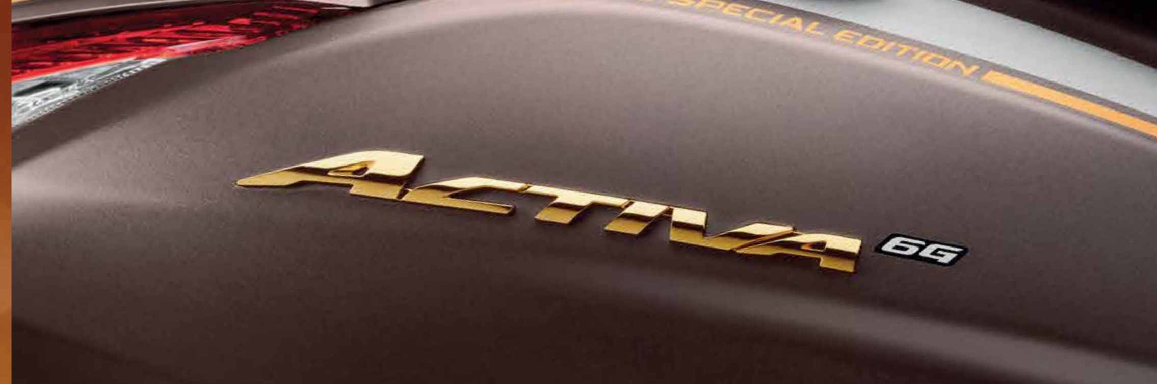
MATTE MATURE BROWN METALLIC